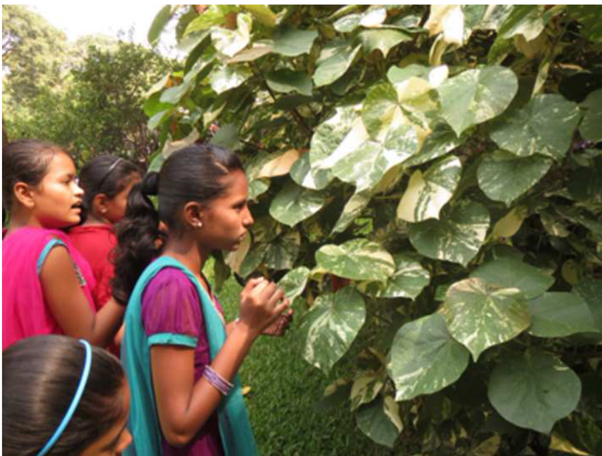
Figure 1: The bhendi tree (variegated Talipariti tiliaceum ).