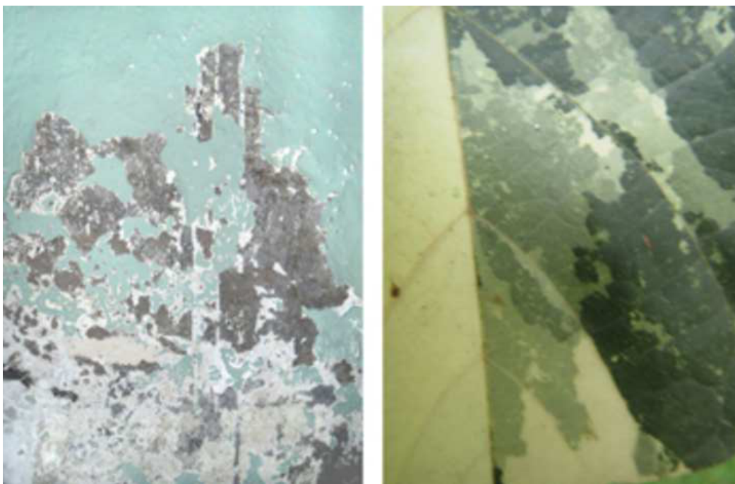
Figure 4: Colour change? Paint chipping off a wall, compared to a variegated bhendi leaf.

Our interpretation is that at 2:26 Tejas was asking an authentic question as to whether the leaves used to be green but had now lost some of their colour. He was confronting a conflict between the strange leaves he was observing and previous leaves that he had observed. The variegated leaves may have reminded him of the way a wall looks when its paint starts chipping off ( Figure 4 ), and by analogy he hypothesized that the green colour was chipping off the leaves. He wanted to test this hypothesis by performing an investigation: scratching the leaf to see if the green colour comes off easily. However, he had been warned by Ashish, and he was afraid that he might get in trouble if he touched or disfigured them. He did not think that his question or investigation was valid or was considered to be science in the eyes of teachers.