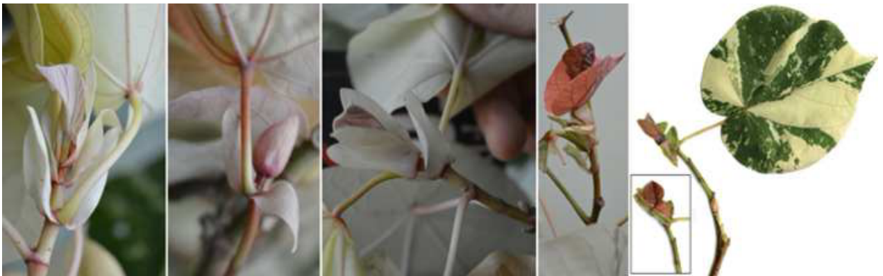
Figure 7: Possible flowers: It may be difficult to immediately tell whether these plant parts are flowers, leaves, flower buds or leaf buds. Some of them are actually leaf stipules. Immature stipules can be pried apart to reveal tiny, folded leaves inside. We have never observed actual flowers or fruits on this tree, although we have not seen them on other specimens of variegated bhendi.

As Piaget (1923, pp. 1-29) also pointed out, people, and especially young children, have a tendency to sometimes use an audible 'internal' speech, in which they 'talk to themselves' rather than to communicate with others, even though an audience may be required. We noticed many examples, in addition to this private (internal) question Srushti asked, in which students appeared to be asking their questions to themselves. We think this is an important part of the process of making implicit questions explicit. Perhaps forcing students to be silent inhibits this process. In typical classrooms, students' implicit questions may not evolve into