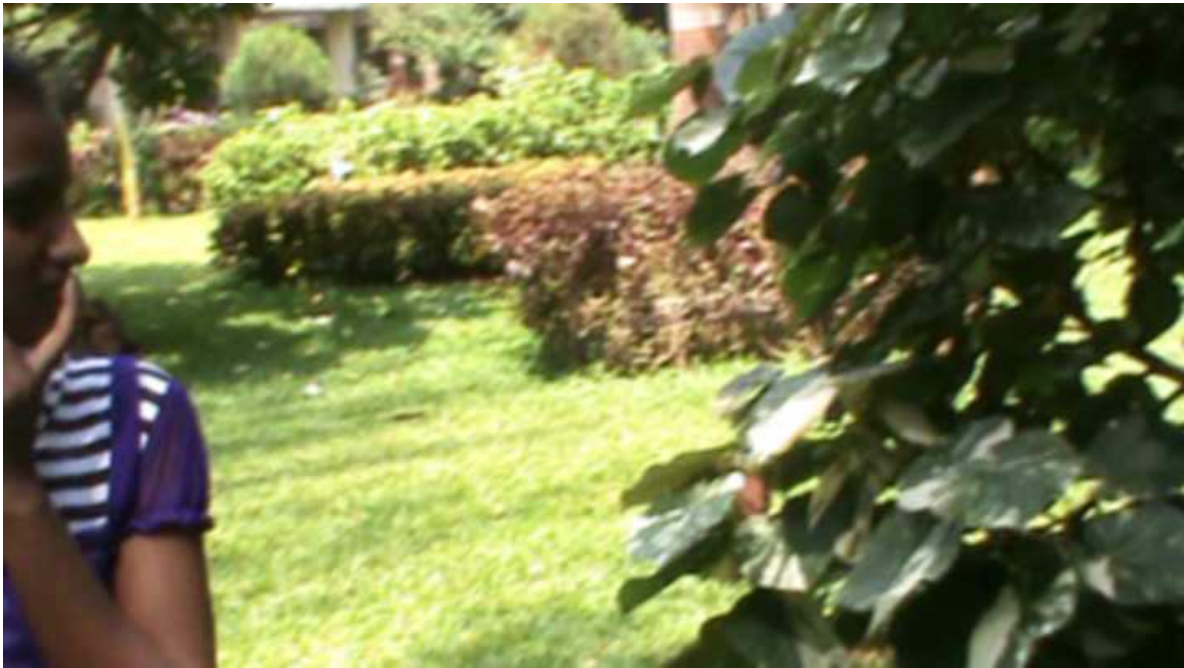
Figure 2: Srushti looking at the tree: At 2:11 Srushti was filmed looking at the tree with one finger on her teeth. We think this gesture may imply that she was asking herself an unvoiced, implicit question, even though she did not voice any question or statement even afterwards.